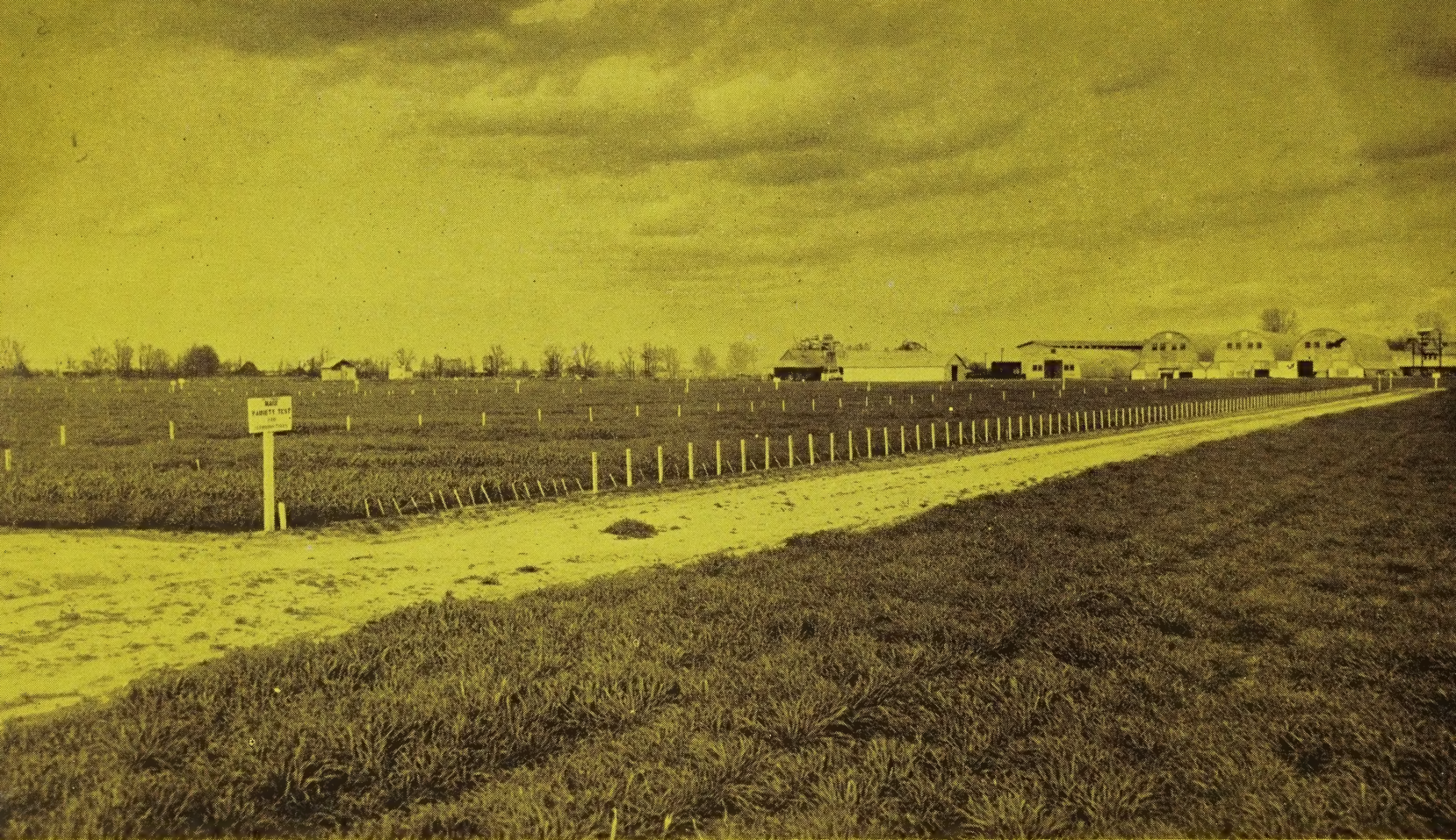
Corner section of test plots, showing processing buildings in the background.